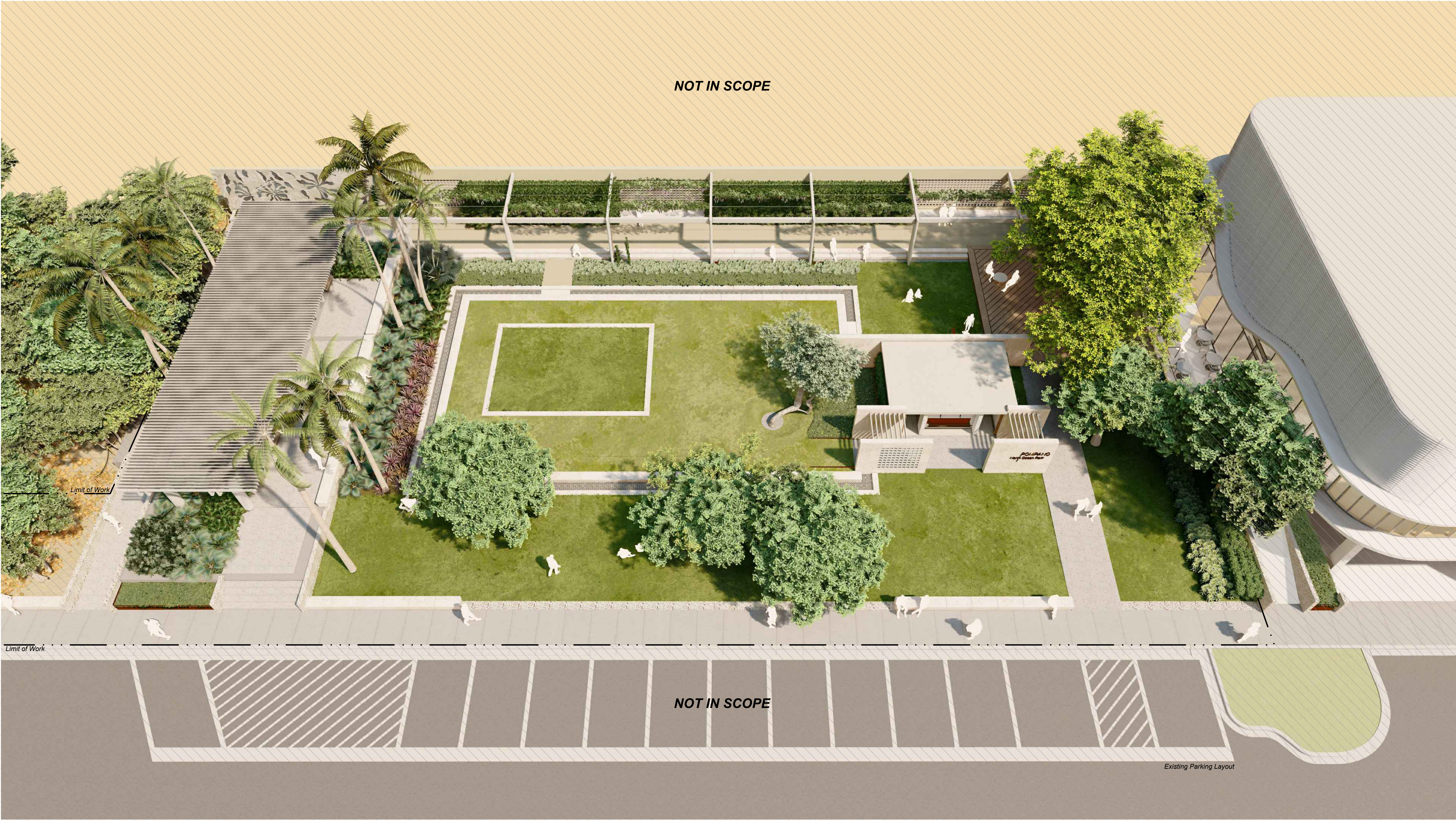
1 PARK 3D OVERVIEW L-102 NTS

NOTE: FOR ILLUSTRATIVE PURPOSES ONLY. REFER TO SITE PLAN FOR FURTHER INFORMATION.